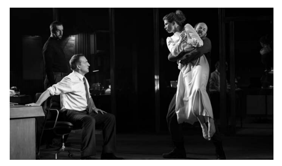
Scene from the 1982 New York Shakespeare Festival production of Antigone

1831), for example, continue to set the agenda for an astonishing number of interpreters. Many answer him directly; others use him to sharpen, complicate, or flesh out their views or simply to position themselves in some larger debate about specific issues in the play or about literary criticism or philosophy more generally.